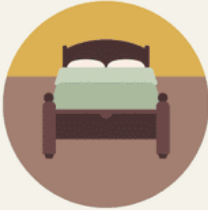
Making a bed