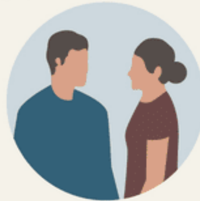
Giving someone advice